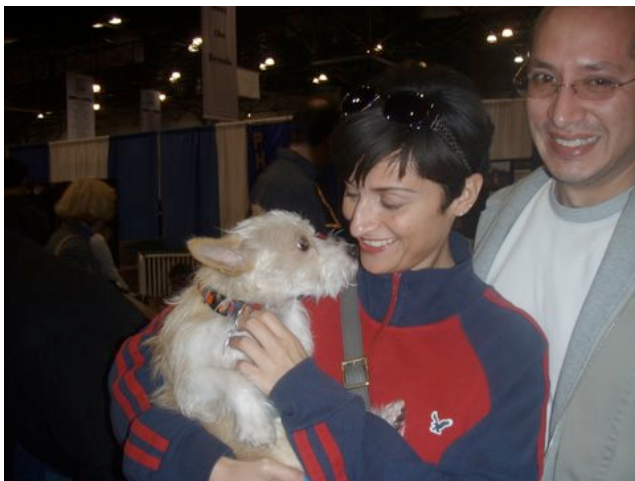
A visitor takes Lali for a test drive

We gave out over 700 of our “famous” I’ve been Podengoad! stickers during the day. The PPPCA introduced this popular item last year and this year we saw several other breeds with their own stickers!