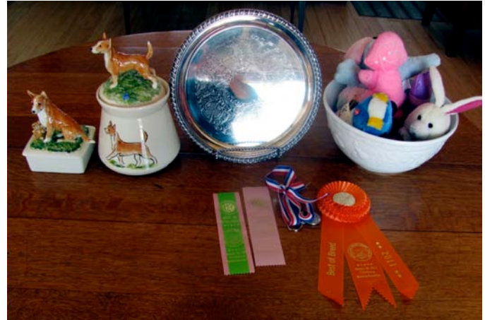
Some of the Prizes from the Nolan River and Merrimack Valley KC PPCA Supported Entries